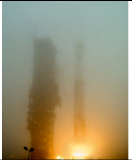
Lift-off of AV-017 carrying the DMSP satellite for the Air Force.

Centaur and other cryogenic space propulsion systems, such as the Delta IV second stage and Saturn V's S-4B stage, use on-orbit settling to separate liquid from gas. This separation is