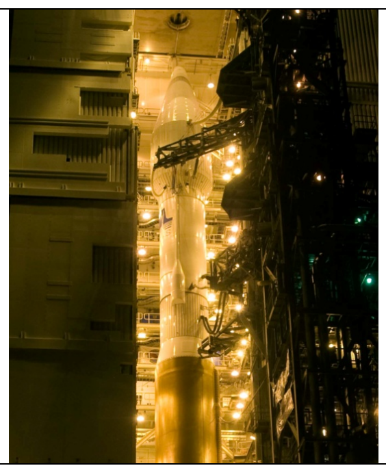
Centaur's sidewall was painted white and numerous dedicated instruments were added to support the on-orbit CFM demonstrations.